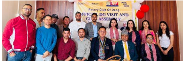
DG Visit RC Dang