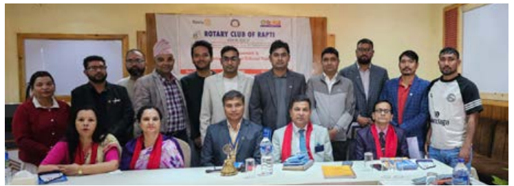
DG Visit RC Rapti