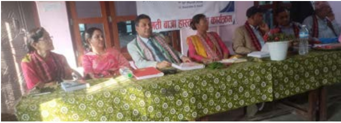
DG Visit RC Butwal South