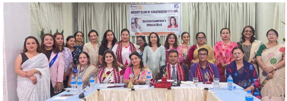
DG Visit RC Biratnagar Central