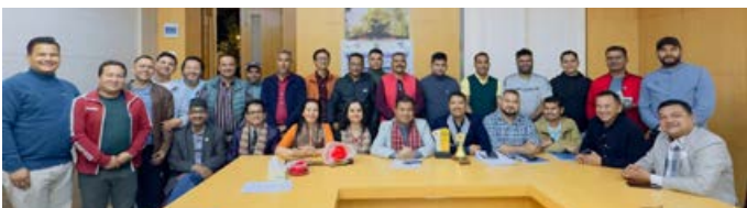
DG Visit RC Tulsipur City