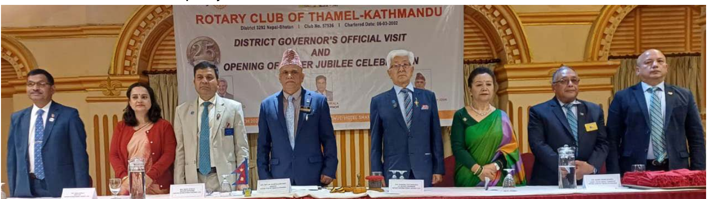
DG Visit RC Thamel Kathmandu