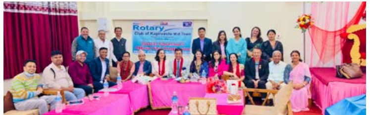
DG Visit RC Kapilvastu Mid Town