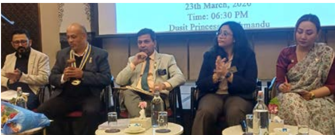
DG Visit RC Kamaladi