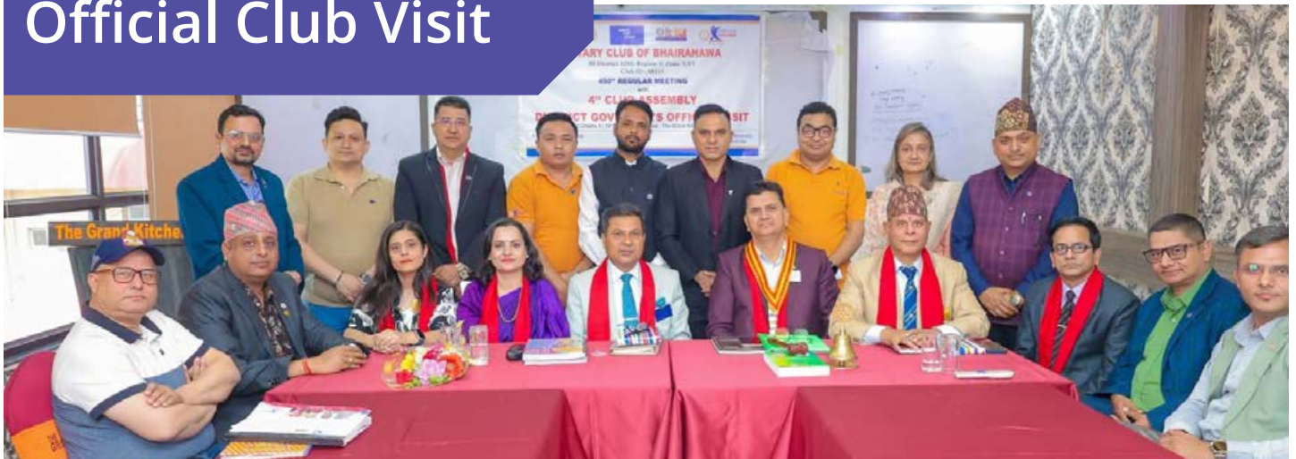
DG Visit RC Bhairahawa

The District Governor's Official Club Visit is regarded as one of the most important annual activities within Rotary International. These visits play a vital role in enhancing participation and strengthening collaboration between district leadership and individual clubs. They ensure alignment with Rotary's overall mission while fostering fellowship, accountability, and a shared sense of purpose.