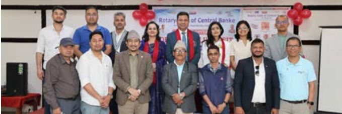
DG Visit RC Central Banke