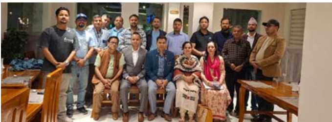
DG Visit RC Lamahi