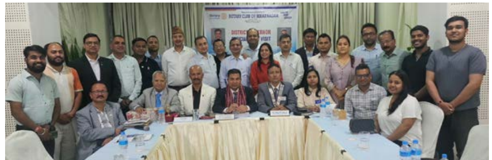
DG Visit RC Biratnagar