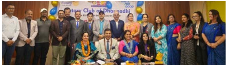
DG Visit RC Dhangadhi