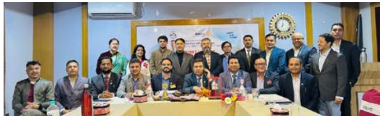
DG Visit RC Pokhara Valley