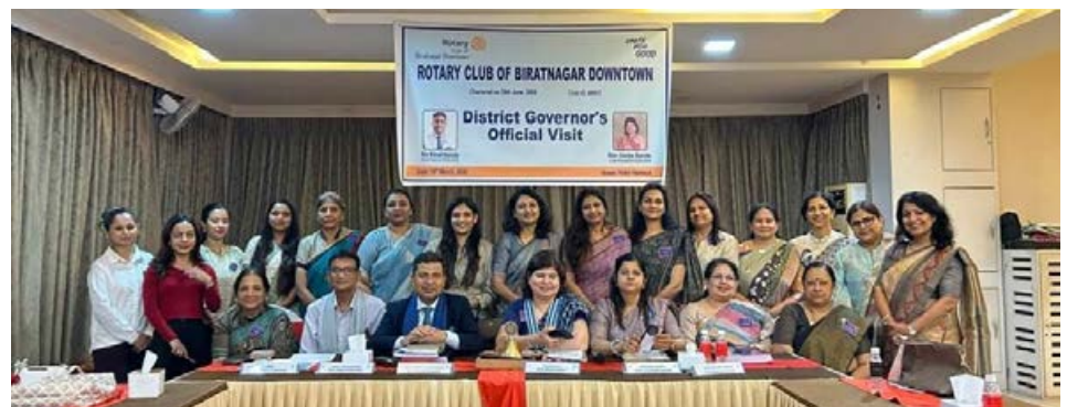
DG Visit RC Biratnagar DOWNTOWN